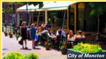
City of Moncton