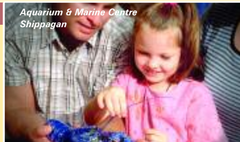
Aquarium & Marine Centre Shippagan