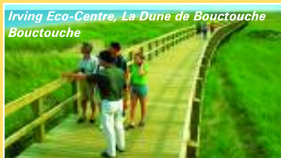
Irving Eco-Centre, La Dune de Bouctouche