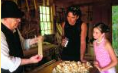
Village Historique Acadien, near Caraquet