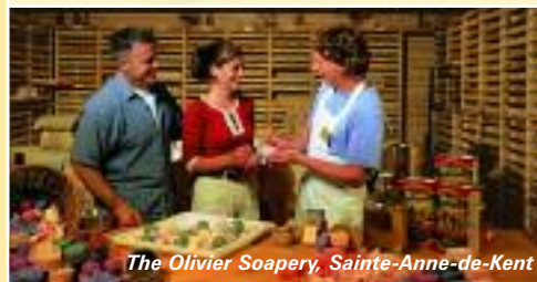
The Olivier Soapery, Sainte-Anne-de-Kent

Look for this symbol, it identifies a business certified by the CTACA